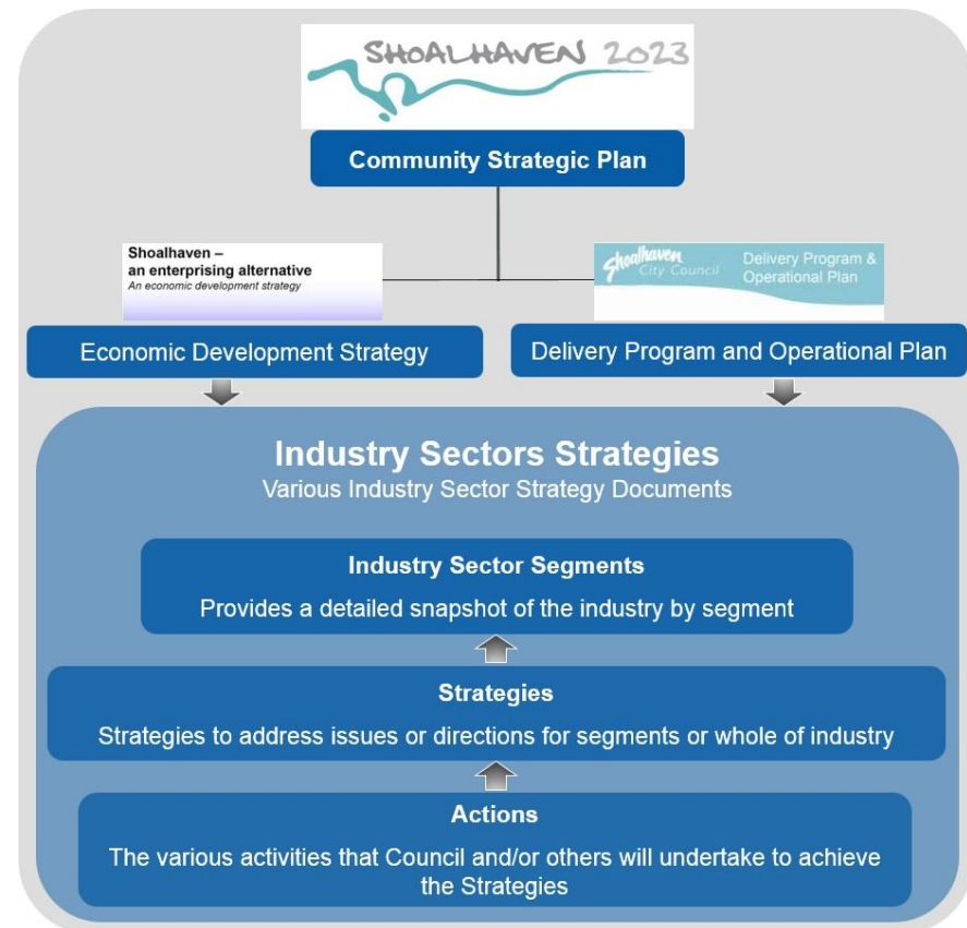
Figure 1: Industry Sector Strategy Flowchart

The relationship between Council's strategic planning documents and this Aquatic Biotechnology Sector Strategy is shown in the flow chart at Figure 1.