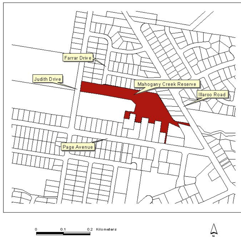
Figure 1. Location of Mahogany Creek Reserve, North Nowra

The Plan also ensures that Council's obligations with respect to the Local Government Act 1993 are taken into account. The Local Government Act 1993 requires that all community land be used and managed in accordance with of a plan of management. Council is required by the Local Government Act 1993 to properly manage, develop, protect, restore, enhance and conserve the environment, in a manner that is consistent with and promotes the principles of ecologically sustainable development.