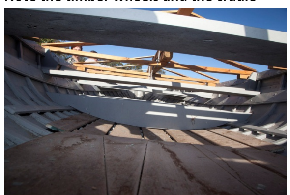
FLOODBOAT : SHOALHAVEN Conservation Management Plan 2015