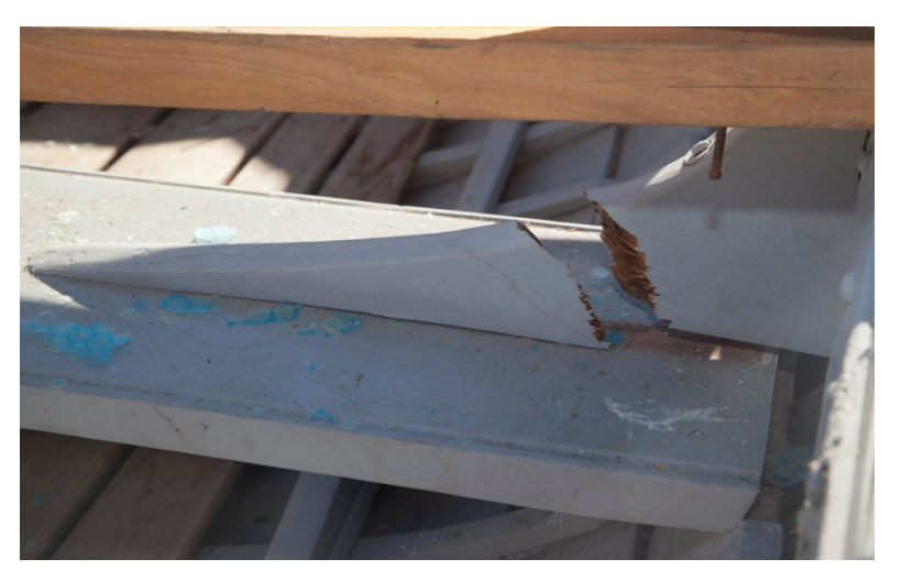
Broken timber in the boat