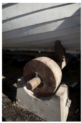
Note shape & good condition of timber wheels and concrete stays.