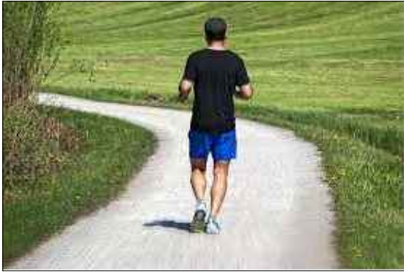
Sealed Access Track.