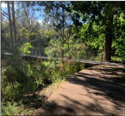
Pedestrian Bridge to Open Grass Area.