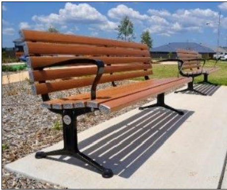
Street Furniture Australia - 'Mall' seat with arm rests.