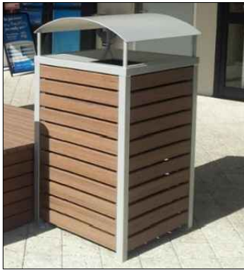
Street Furniture Australia - 240lt Bin Enclosure.