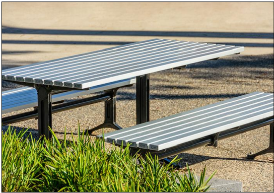
Street Furniture Australia - 'Mall' table setting with end access for accessible seating (AS1428.2).