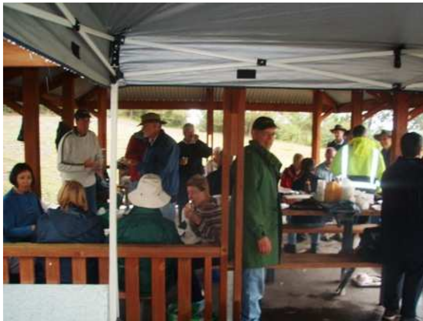
The cheerful gathering at a wet and windy 2008 Bushcare Christmas BBQ.

After many snags consumed, drinks drunk, everyone all agreed that a good time was had by all by the end of the evening. Thanks to those who braved the gale force winds and rain to turn up. The gathering is testament to the hardiness and spirit of the average Bushcarer an Parkcarer in the Shoalhaven.