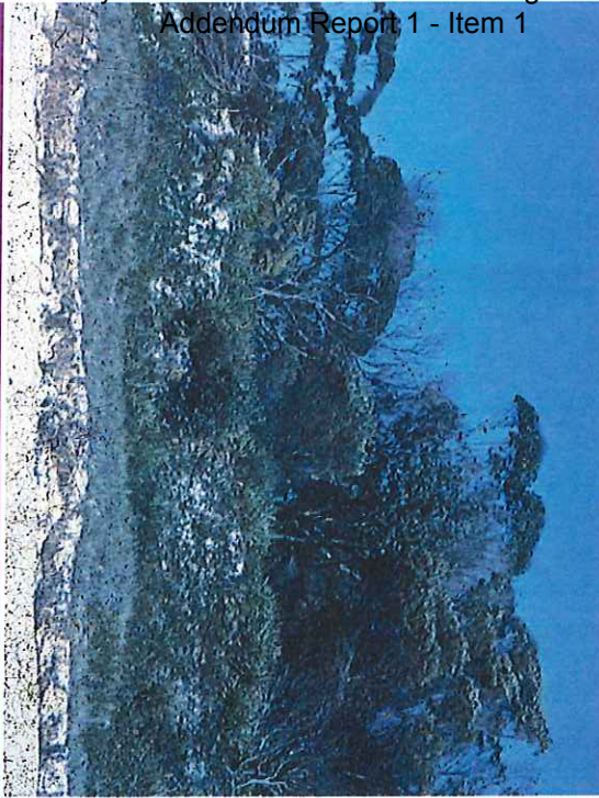
1966 PRE DEVELOPMENT