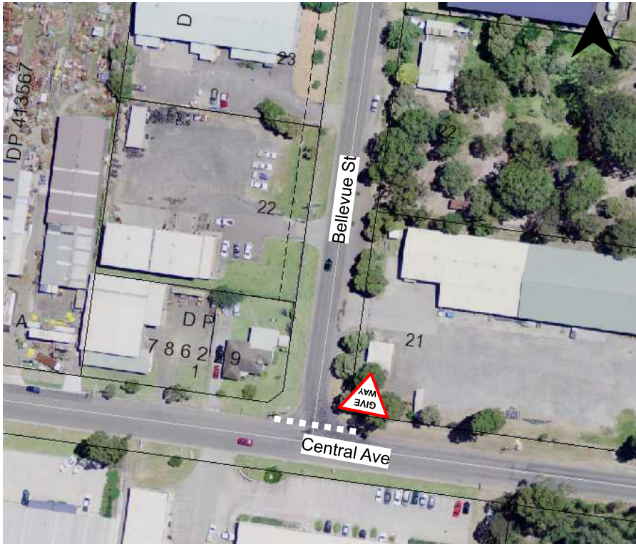
Bellevue St / Central Ave intersection