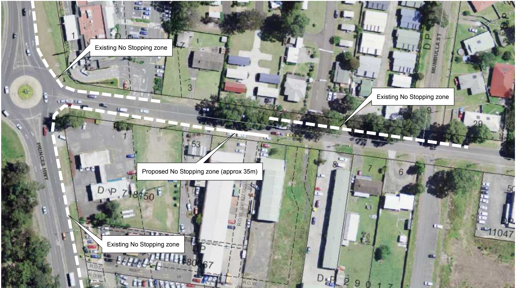
Proposed No Stopping zone Browns Road, South Nowra