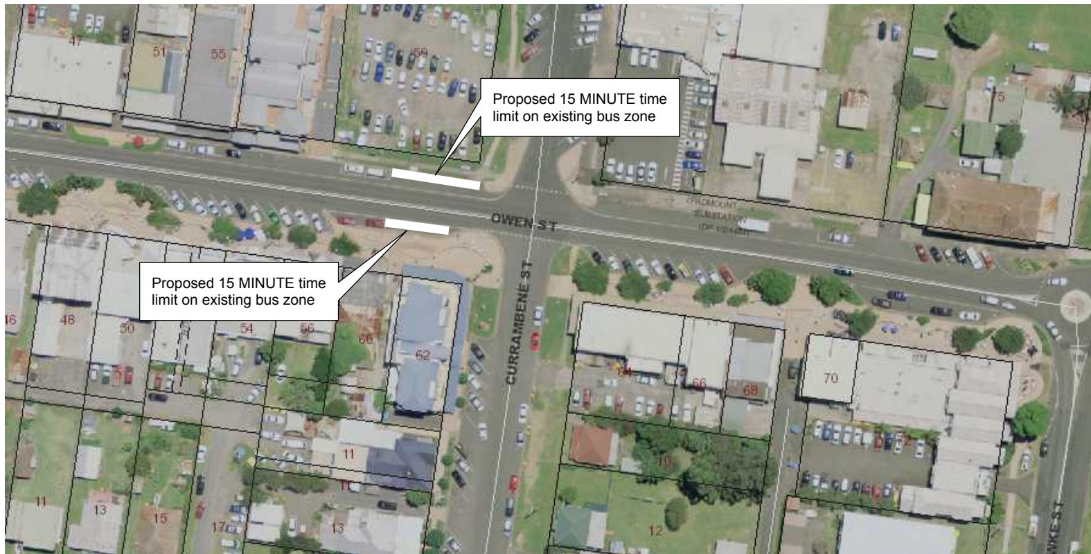
Proposed 15 MINUTE time limit on existing bus zones Owen Street, Huskisson