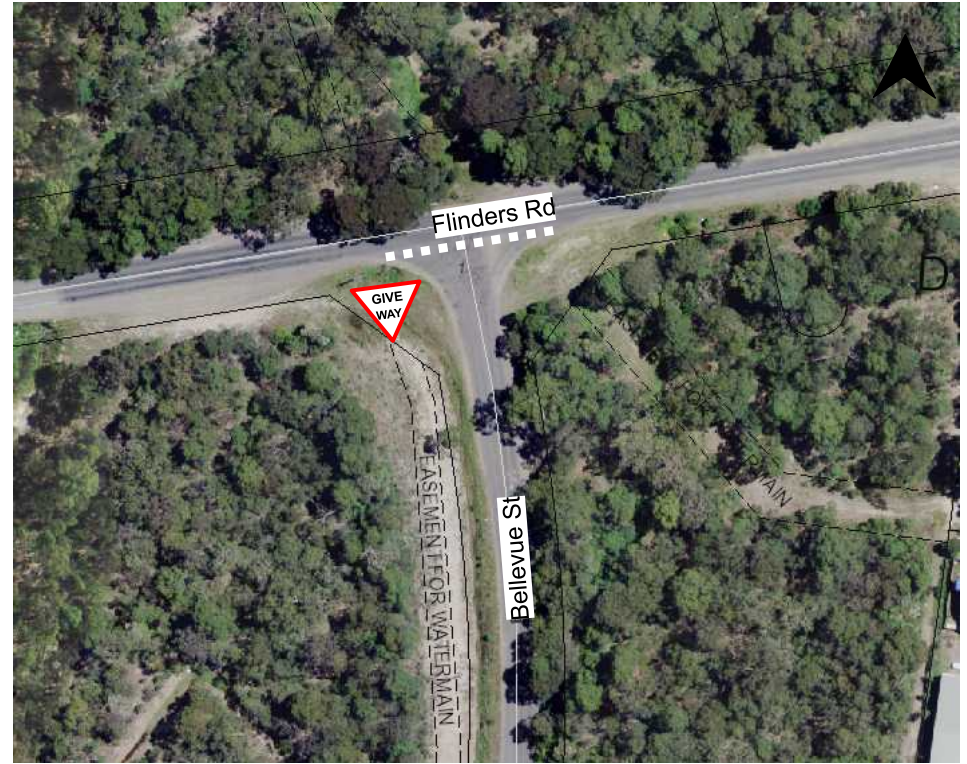
Bellevue St / Flinders Rd intersection