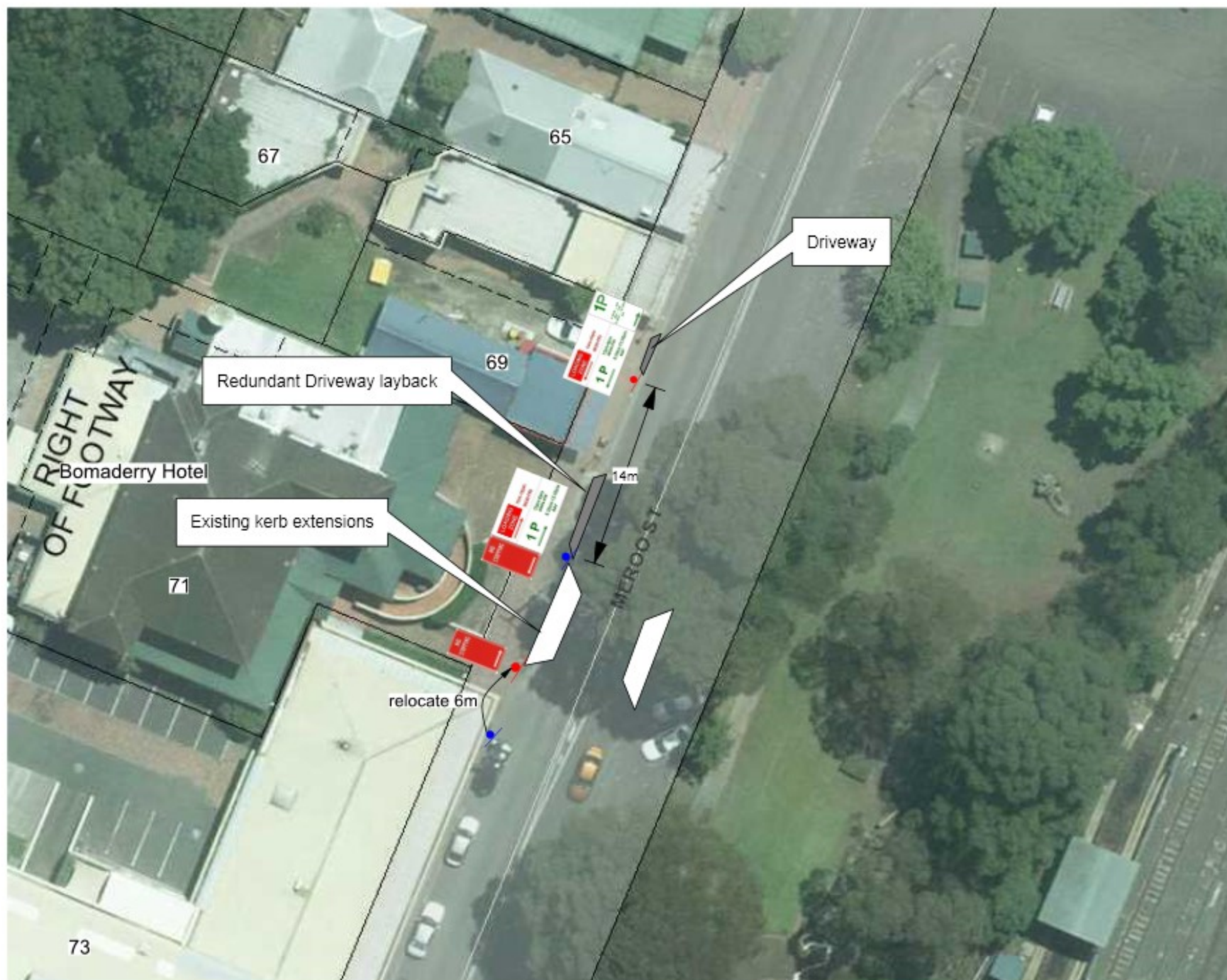
Proposed parking restriction amendments Meroo St, Bomaderry