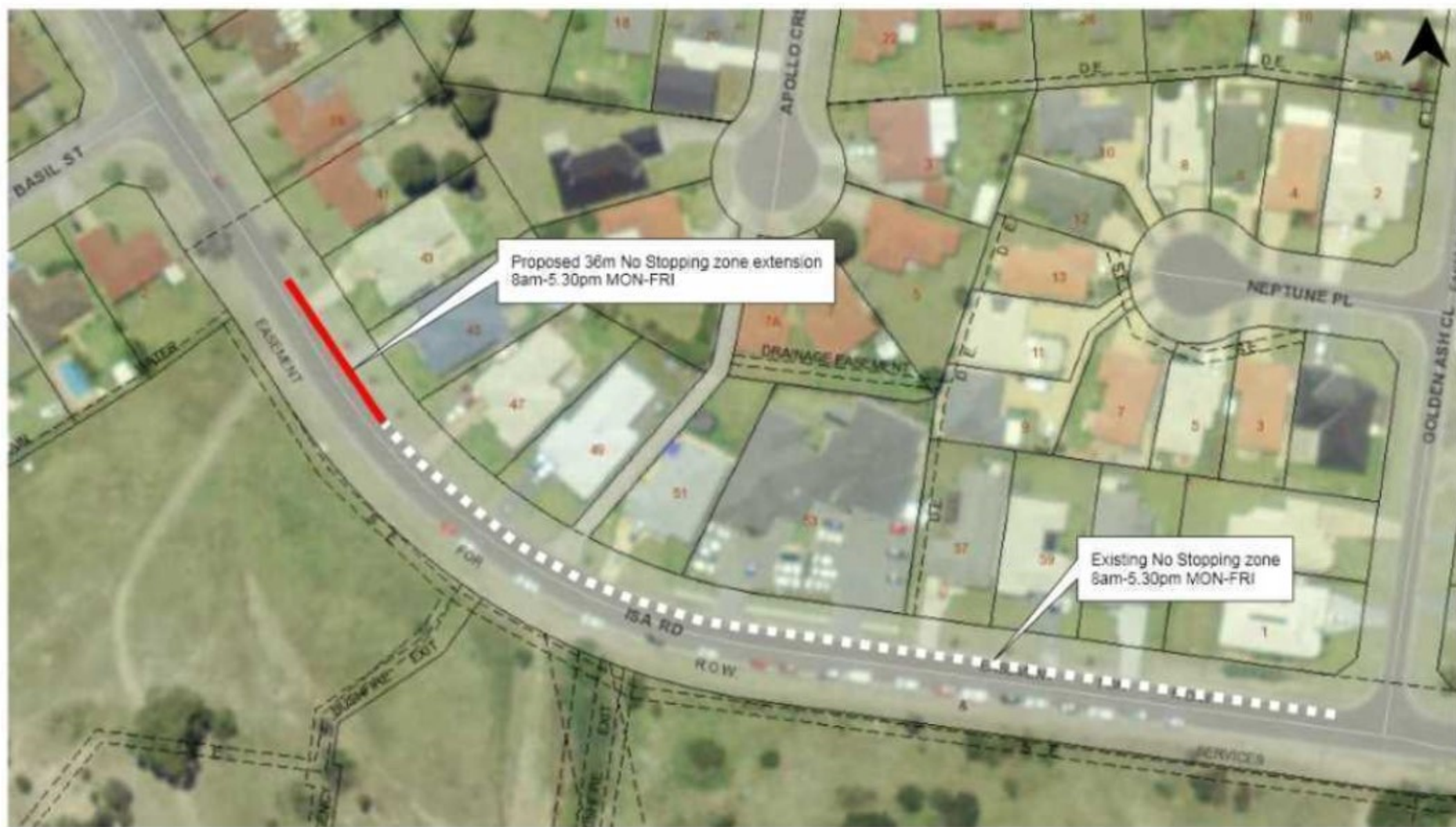
Proposed parking restrictions Isa Road, Worrige