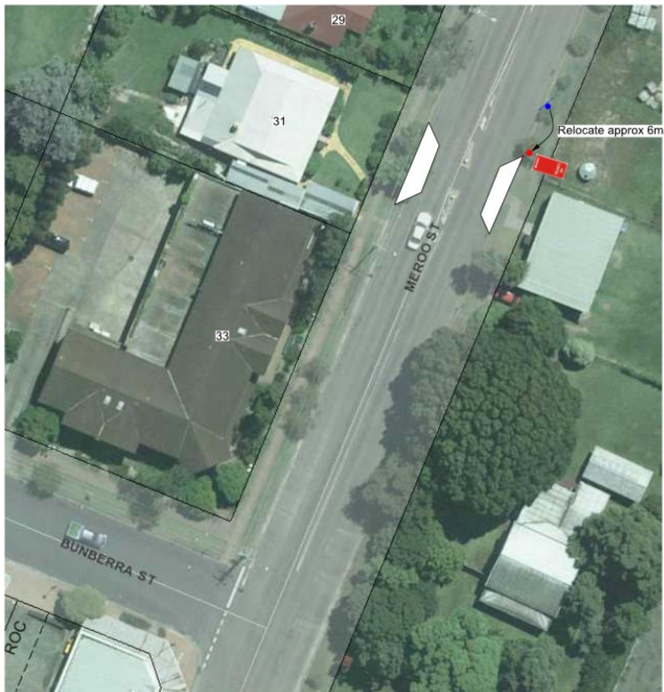
Proposed Parking Restriction Amendments Meroo St, Bomaderry