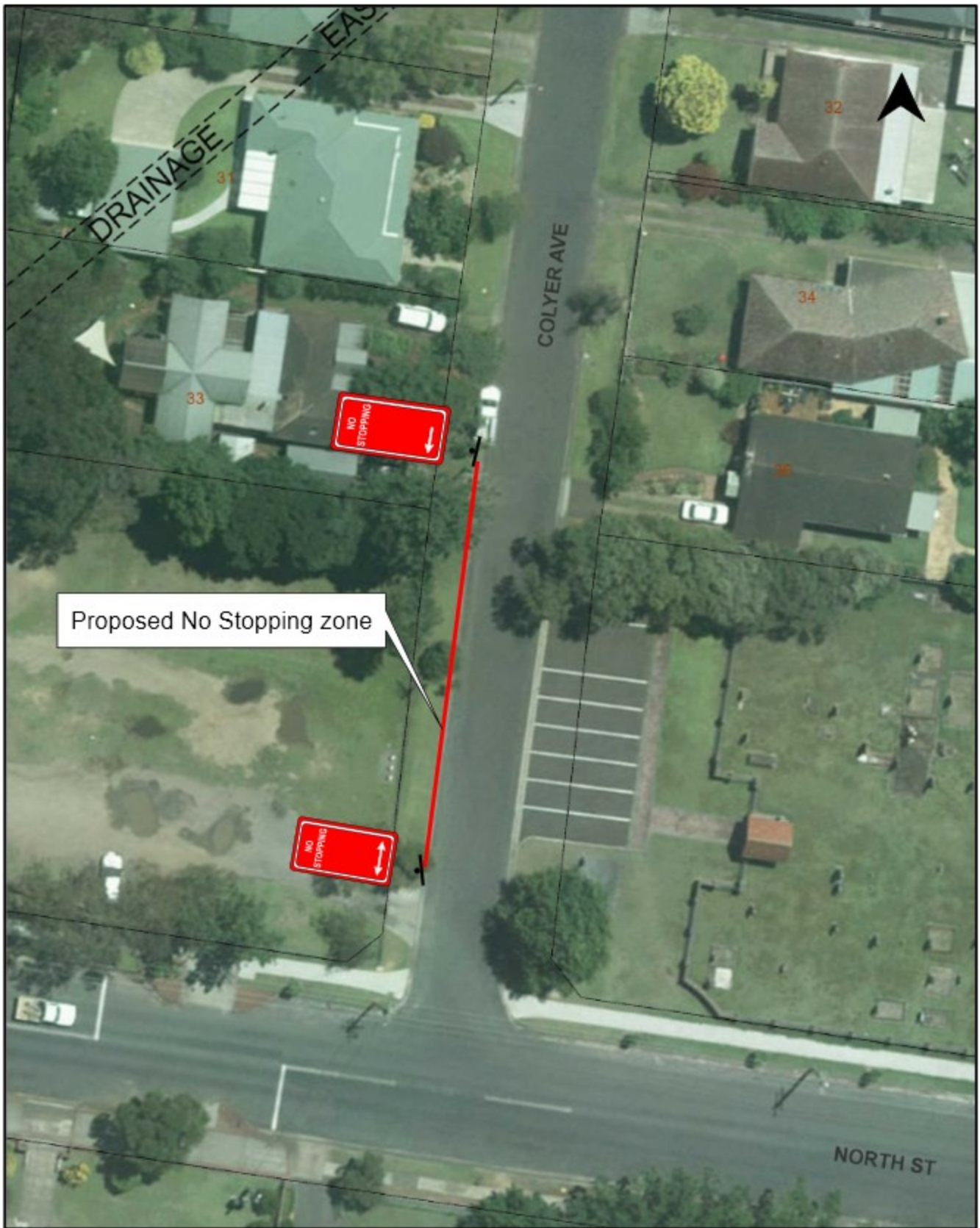
Proposed No Stopping zone Colyer Avenue, Nowra