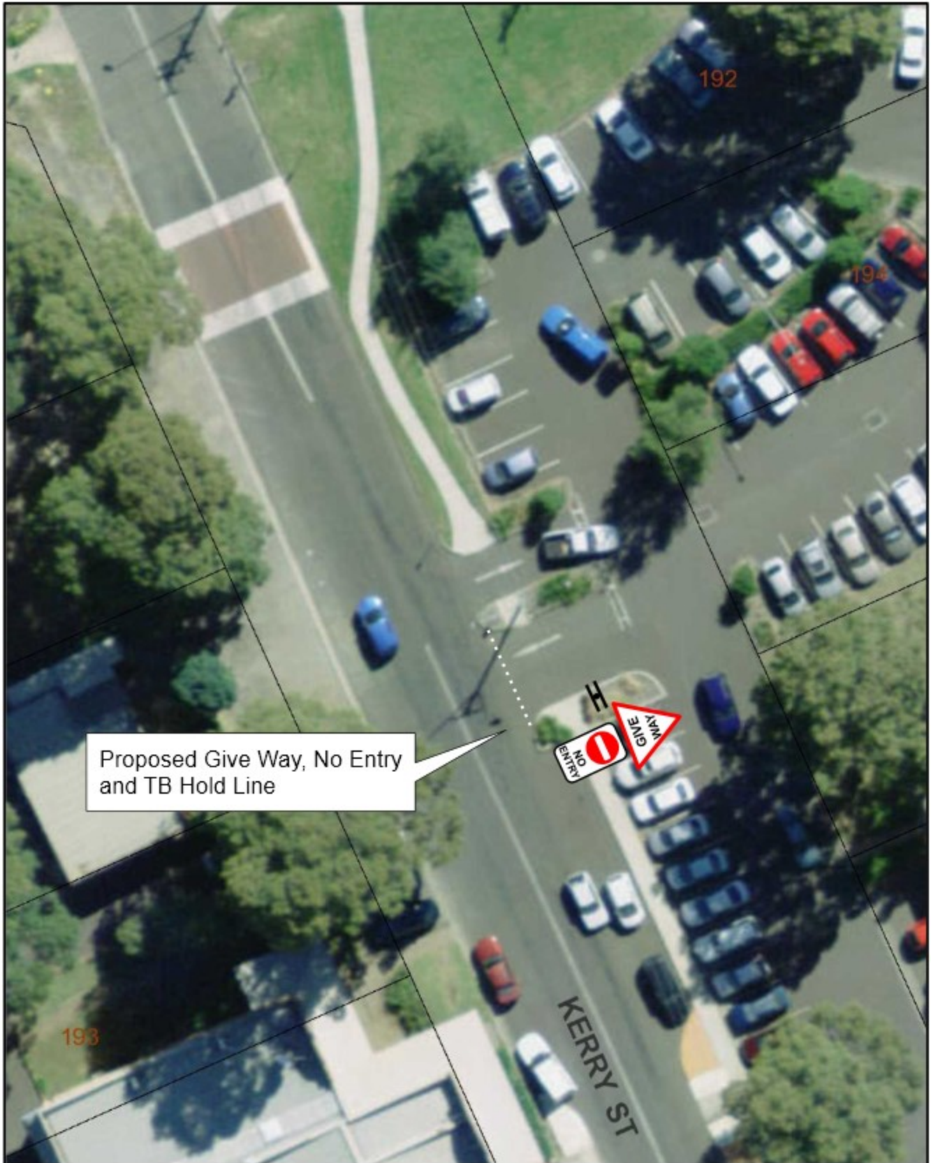
Proposed Give Way and No Entry Signage Kerry Street Carpark Exit, Sanctuary Point