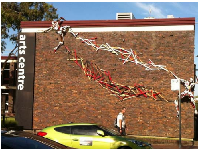
Sculptural Work – Wood and Metal