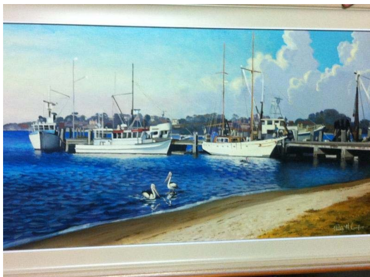
Greenwell Point Wharf c.2000