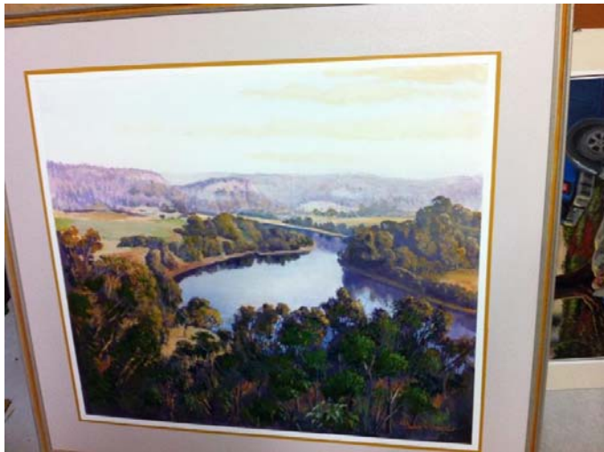
Shoalhaven River (with Pulpit Rock)