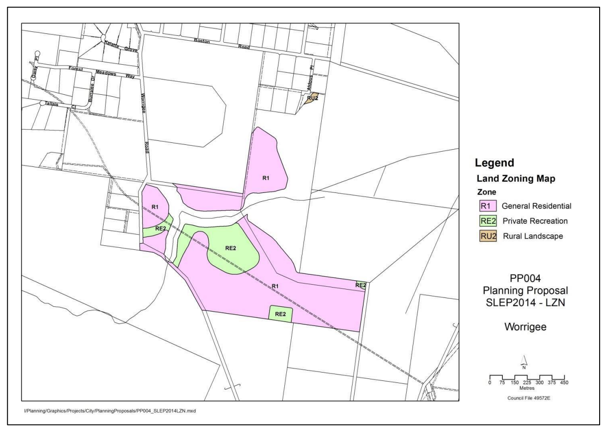
Figure 1 - Existing Land Use Zones, Shoalhaven LEP 2014