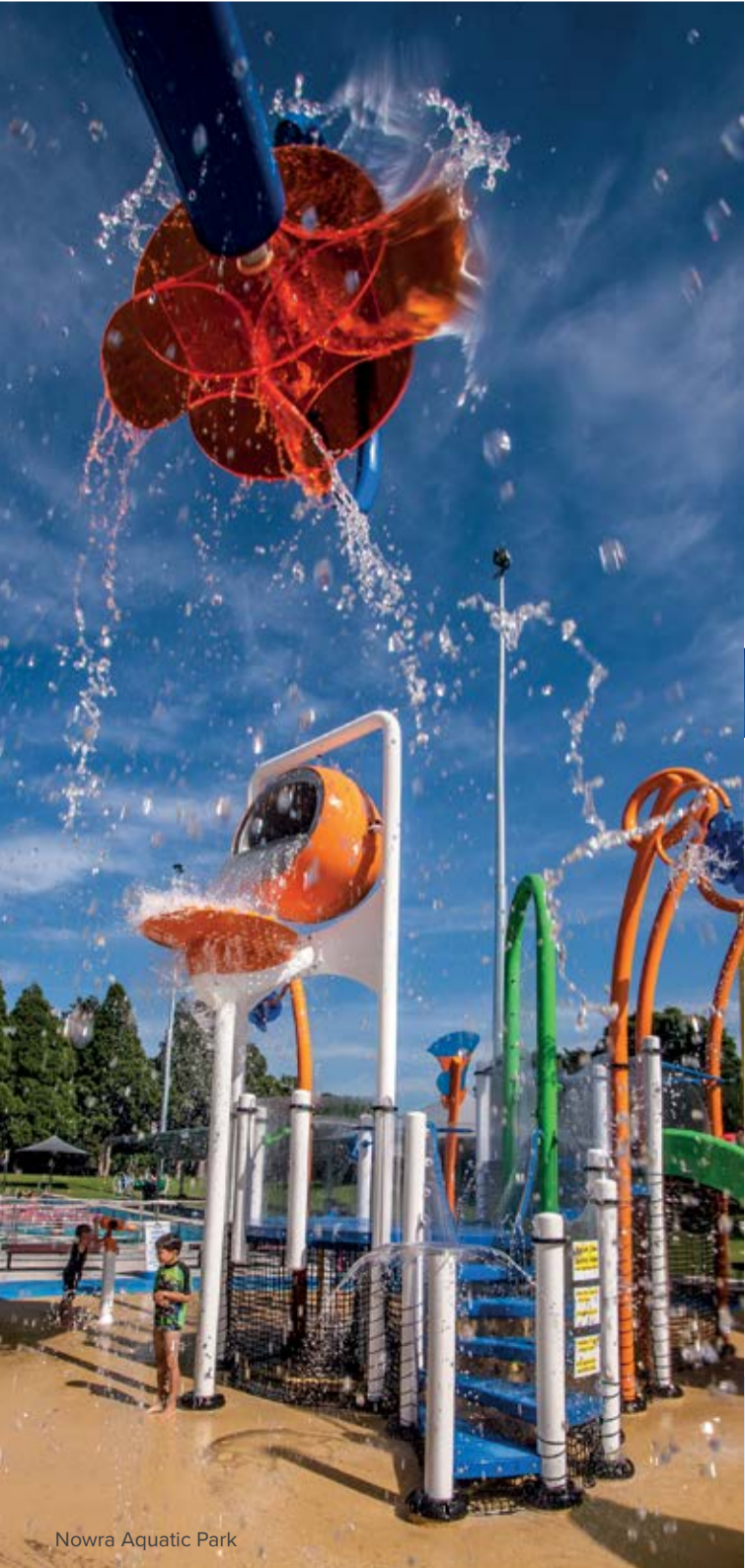
Nowra Aquatic Park