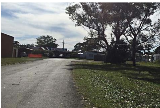
Ellmoos Avenue car park - before and after.

Sussex Inlet - Ellmoos Ave – The construction of a new 59 space carpark on Ellmoos Avenue has been completed. During the works, access was cut off to the rear of the adjoining businesses. Council thanks those affected for their patience during this period. The end result is a wonderful addition to the parking capacity of the