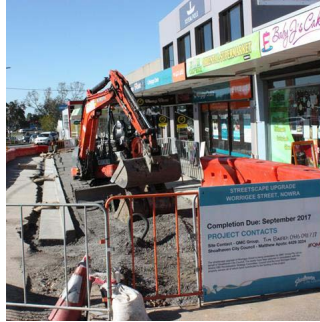
Above - Worrige Street