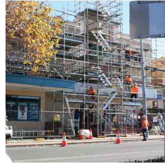
Below - Roxy Cinema Complex Nowra