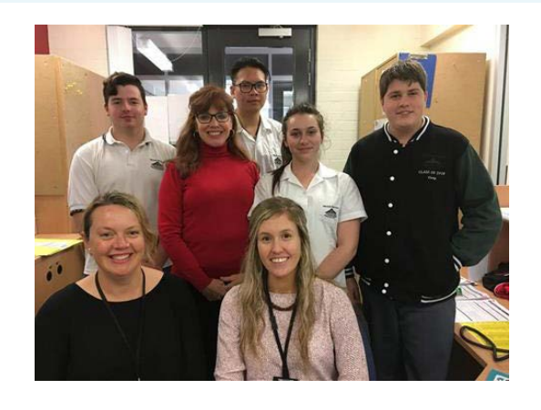
In the Community

Shoalhaven City Council staff visited Ulladulla High School's Year 11 English