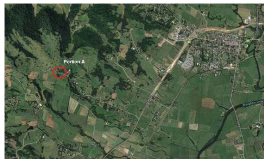
Below: Budgong Fire Trail Budgong bridge location