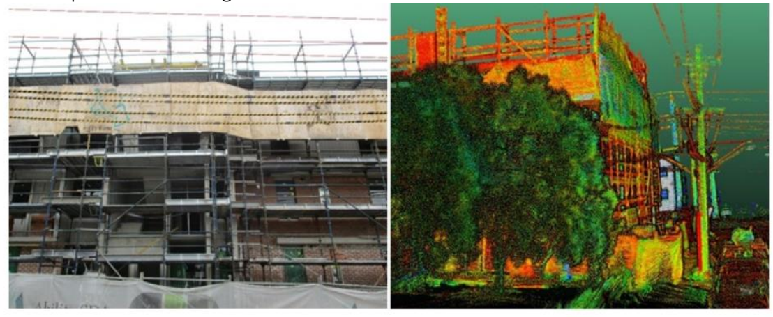
Image 1 (left): Construction site where work was being done – noting red lines indicate where the power lines were located. Image 2: (right) Lidar scan image, showing construction site and power lines where work was being done.

SafeWork NSW, NSW Police Force and other Emergency Services responded to the incident. The site is located at Guildford. Work being done at the site involves the construction of a low-rise apartment building.