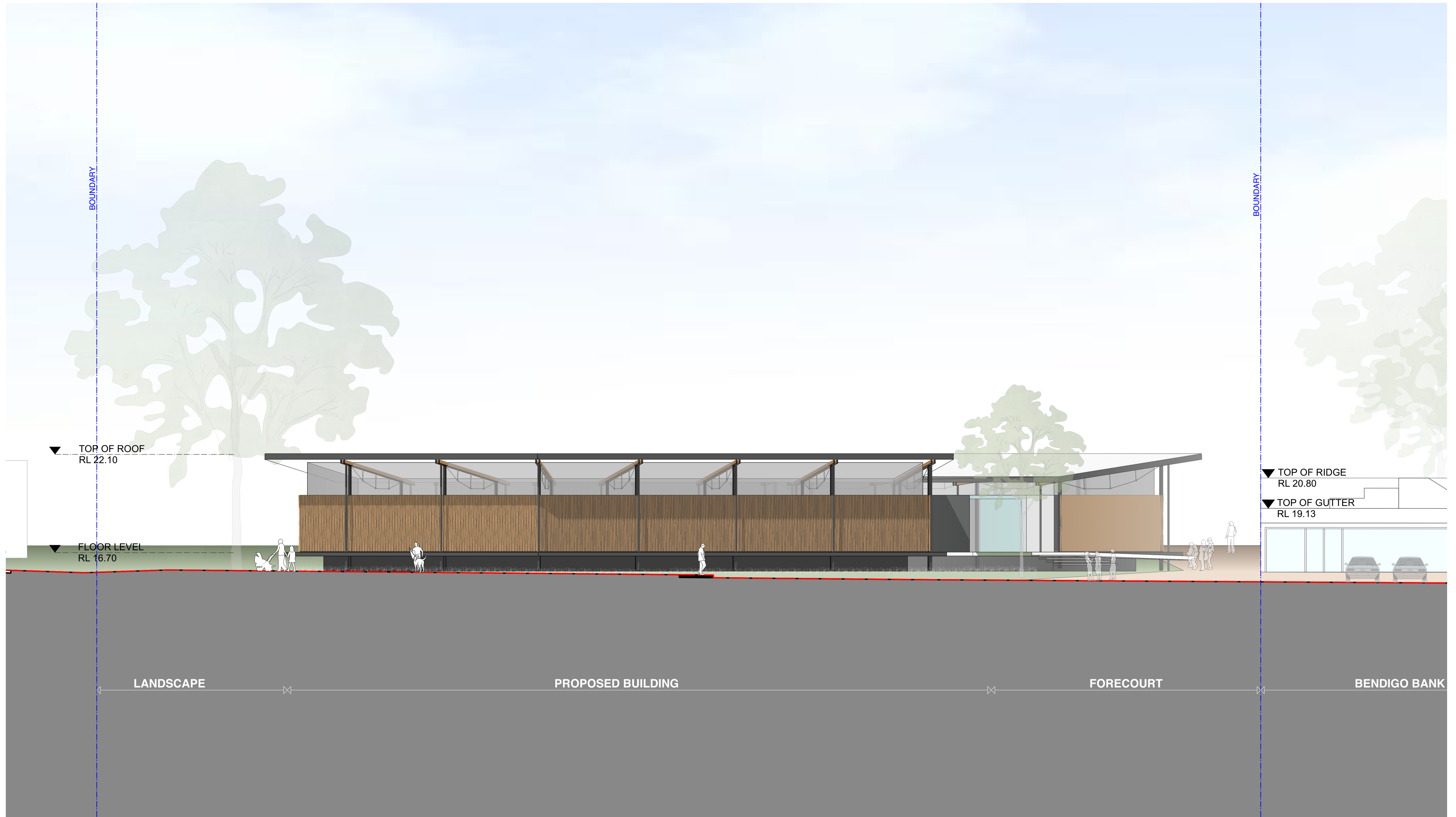
West Elevation | Scale 1 : 100