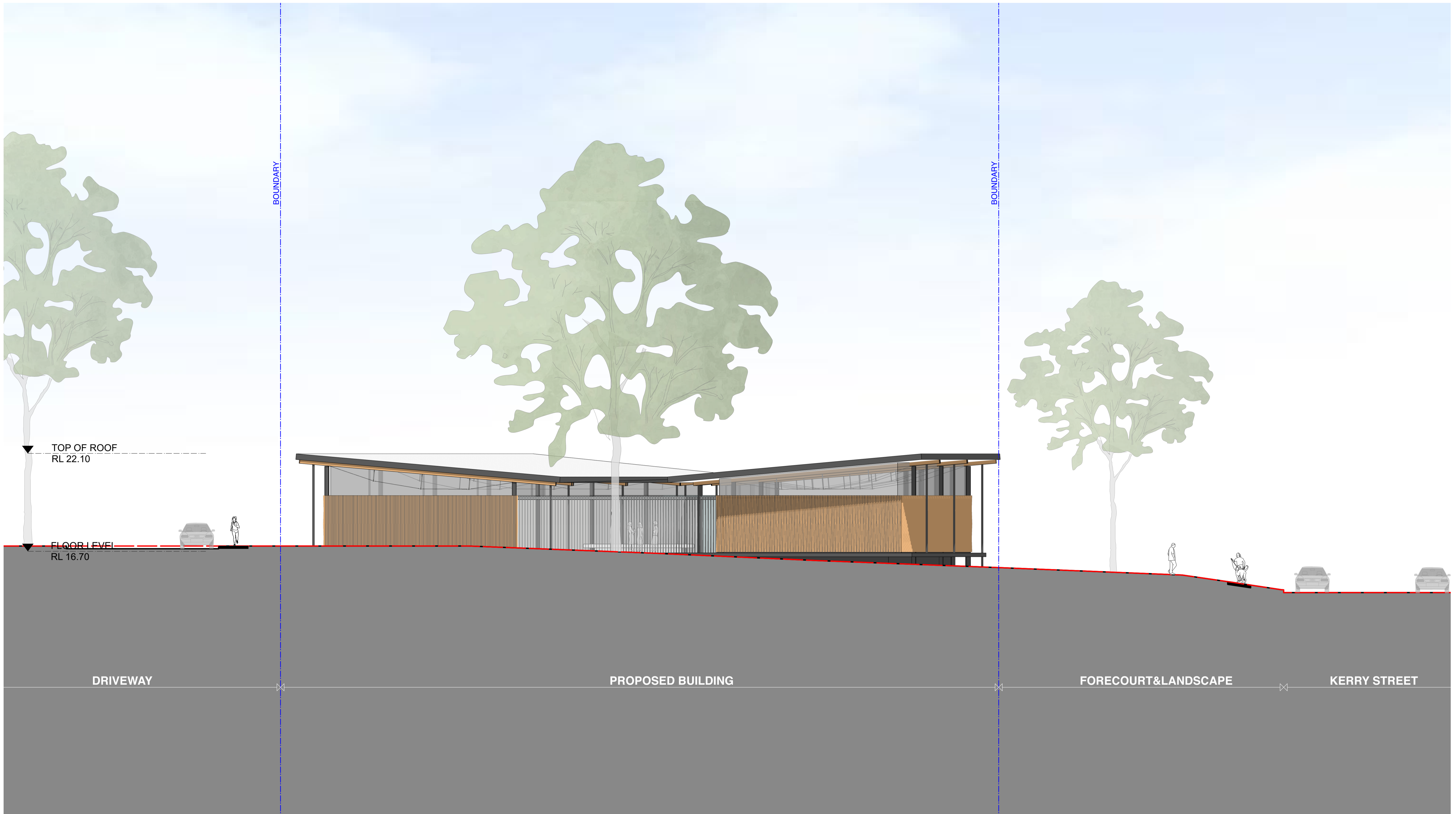
North Elevation | Scale 1 : 100