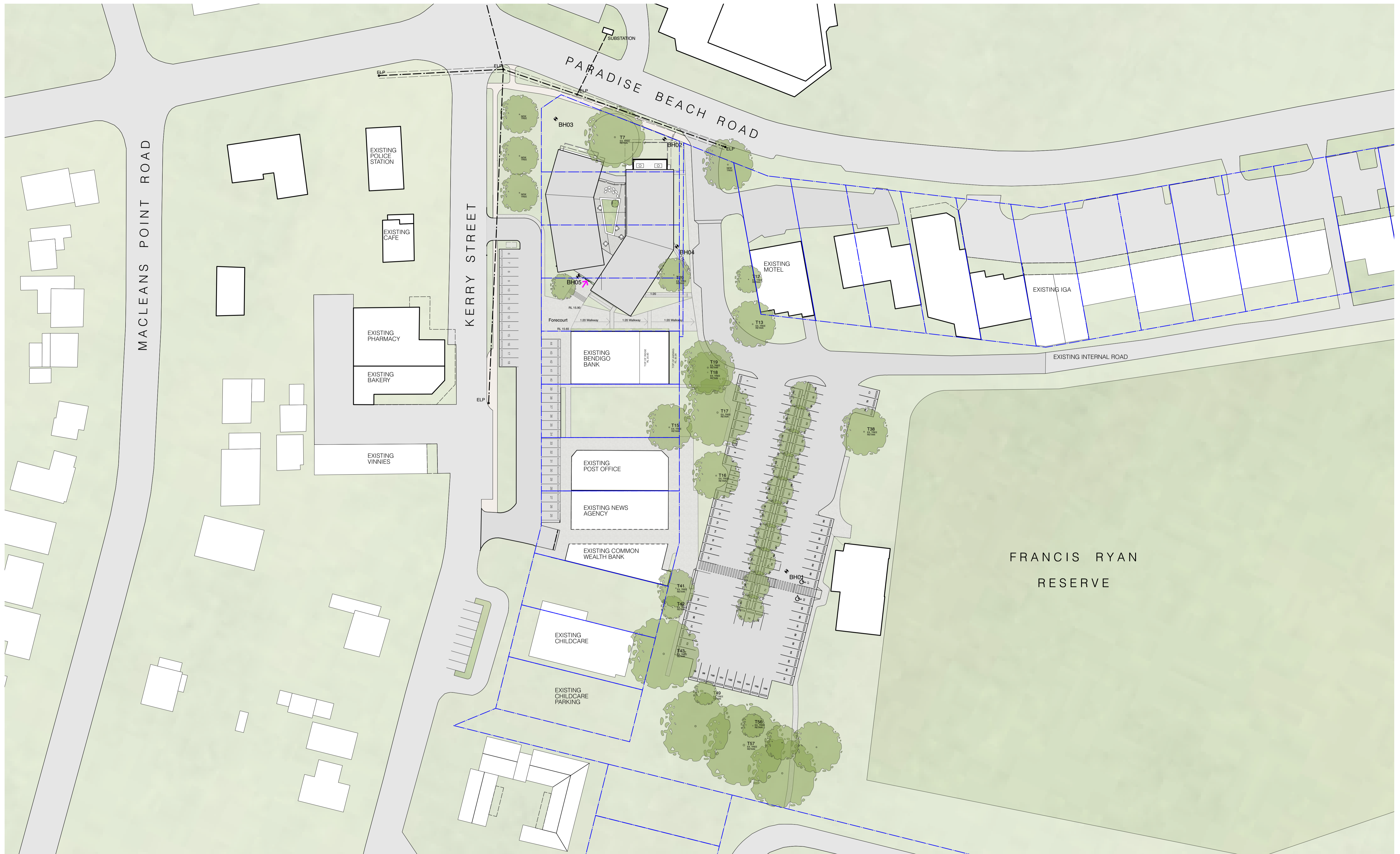
Precinct Plan | Scale 1 :500@A1