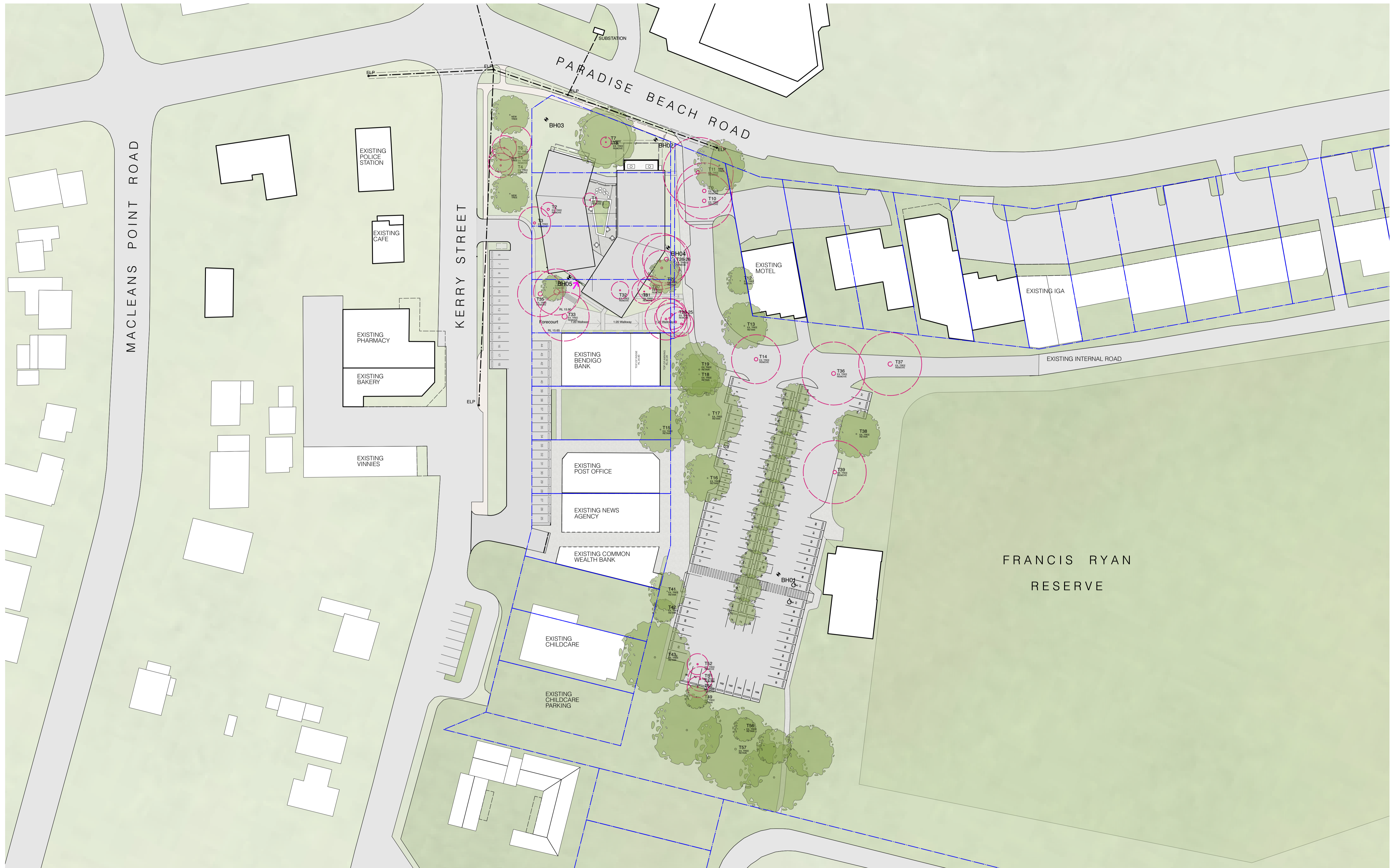
Demolition Plan | Scale 1 : 500@A1