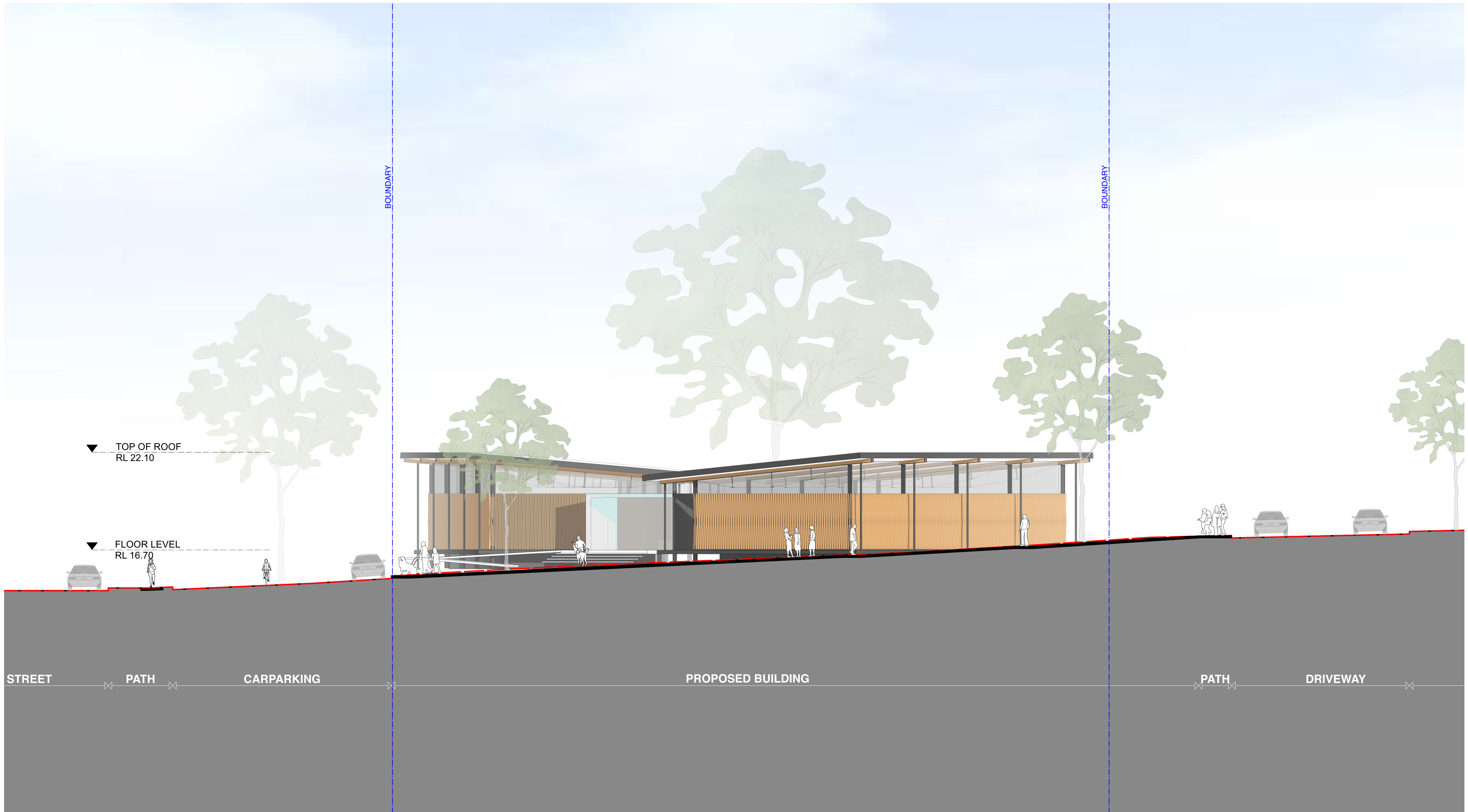
South Elevation | Scale 1 : 100