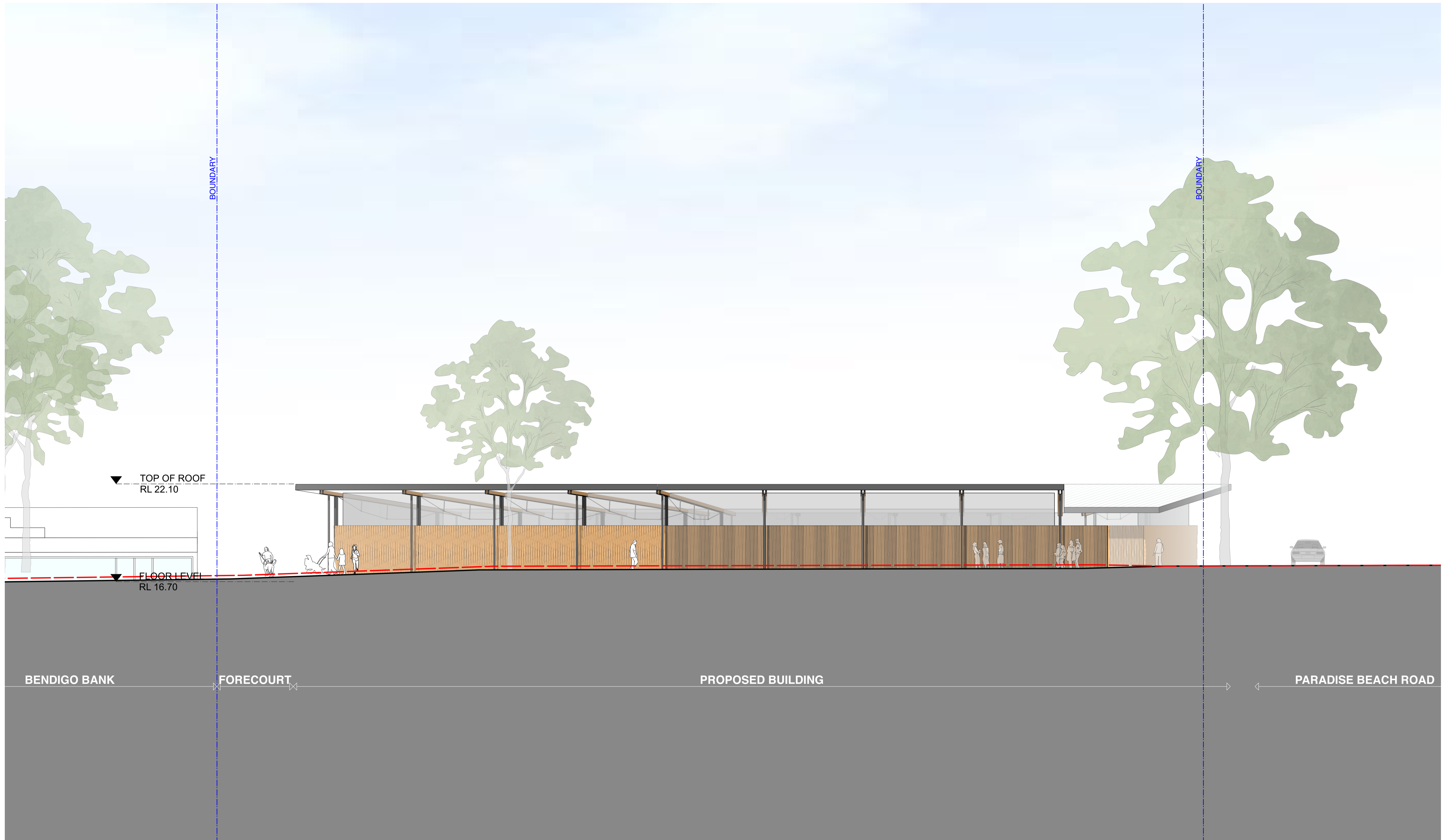
East Elevation | Scale 1 : 100