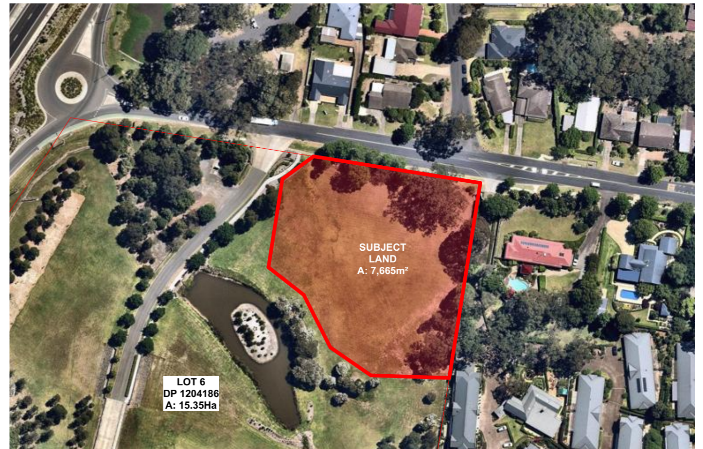
3 LOCATION PLAN