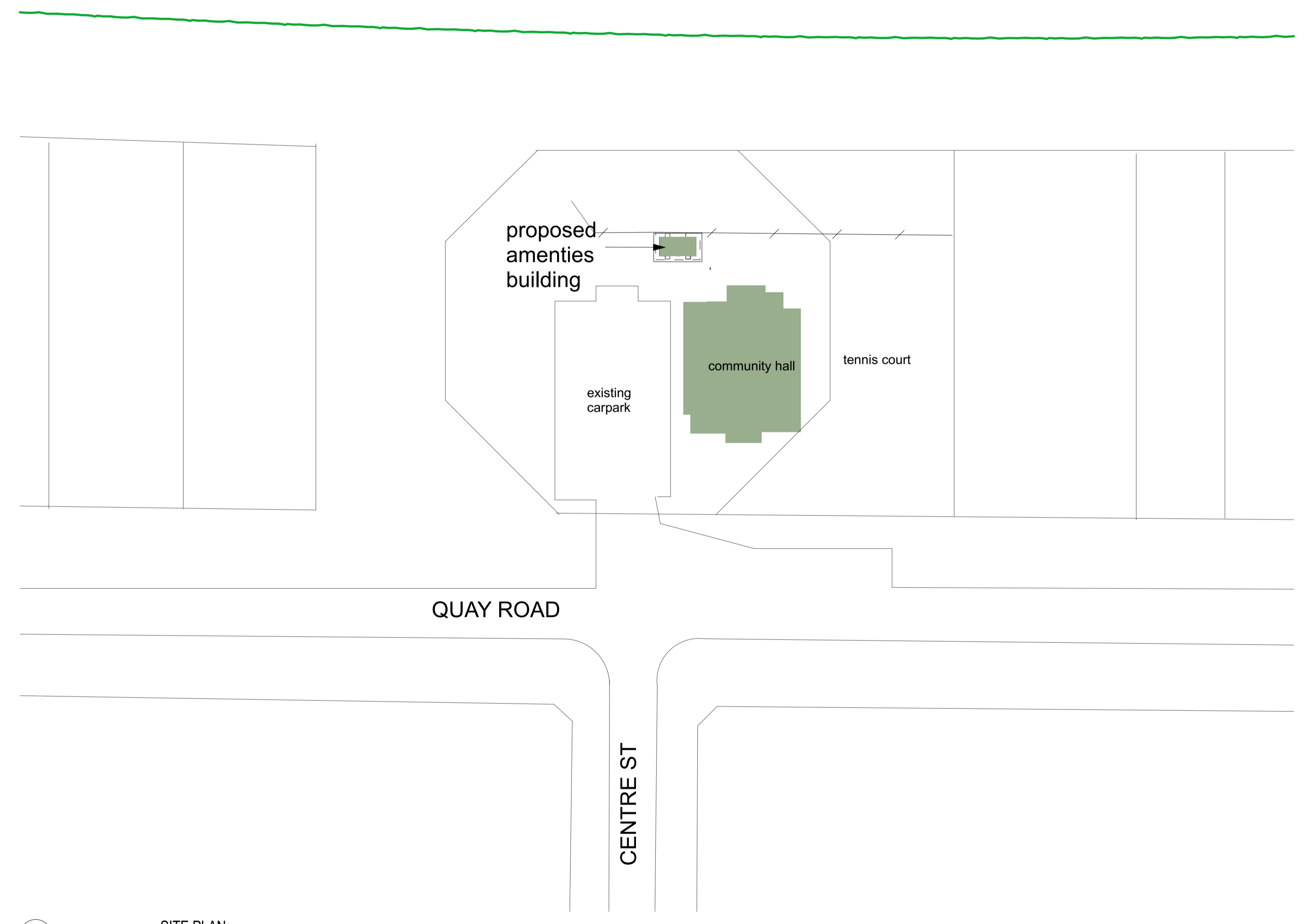
1. SITE PLAN 1:500

METAL ROOF SHEET COLOUR TO MATCH EXISTING COMMUNITY HALL BLOCKWORK TO BE BAGGED AND PAINTED TO COLOUR MATCH EXISTING COMMUNITY HALL CONCRETE PATH