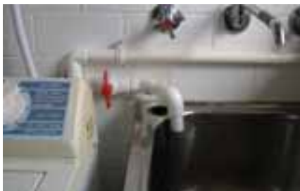
Grey to Green diversion device www.greytogreen.com

A surge tank for a greywater diversion device does not act as a storage tank, but a temporary holding tank to allow an even flow of greywater to your garden.