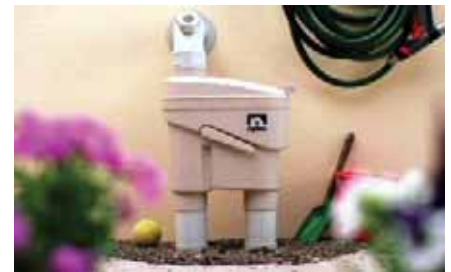
Gravity diversion device from Nylex www.nylex.com.au

A surge tank for a greywater diversion device does not act as a storage tank, but a temporary holding tank to allow an even flow of greywater to your garden.