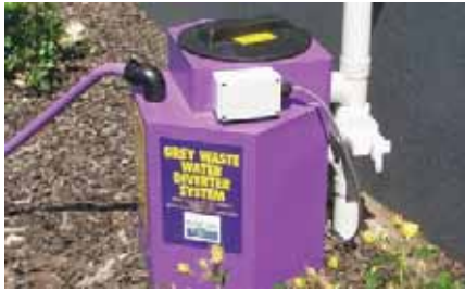
A pump diversion device – the EcoCare Grey Waste Water Diverter System www.ecocare.com.au