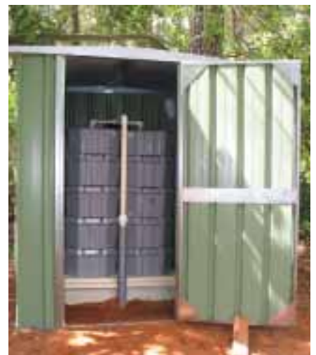
AquaReuse Greywater Treatment System www.aquareuse.com.au

Greywater Fact Sheet 5: Maintenance of greywater treatment systems and diversion devices