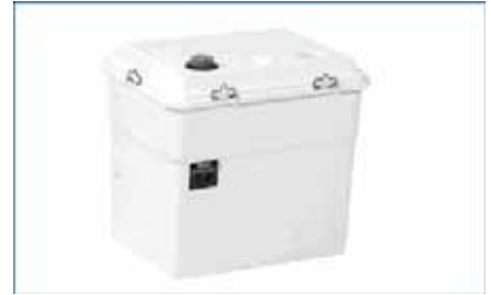
Novabox is an automatic pump station for collecting and lifting domestic waste water from bath tubs, wash basins, showers and washing machines located in basements or below the sewer line.