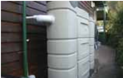
The OASIS GT600 from Nubian www.nubian.com.au

The following provides examples of some accredited systems currently available. Note that these are examples only, and for a full list, please visit the NSW Health website.