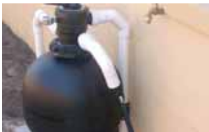
Pump Greywater Diversion System Biological Wastewater Treatment Email: bwt@inet.net.au