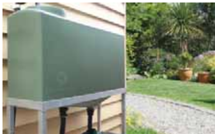
Gravity diversion device system – the Greywater Gardener 230 www.waterwisesystems.com