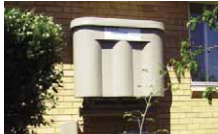
The Aqua Reviva treatment system from New Water www.newwater.com.au