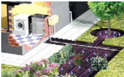
Gflow Grey Water System www.gflow.com.au

Gravity diversion devices are most appropriate for properties that have a slope downwards away from the house to the garden or lawn area. In these systems, gravity provides pressure to move the water from the house to the irrigation system. The following images provide examples of licensed greywater diversion devices. Note that these are examples only, for a full list, please visit the NSW Health website.