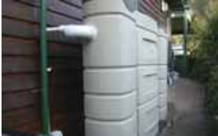
The OASIS GT600 from Nubian www.nubian.com.au

The following provides examples of some accredited systems currently available. Note that these are examples only, and for a full list, please visit the NSW Health website.