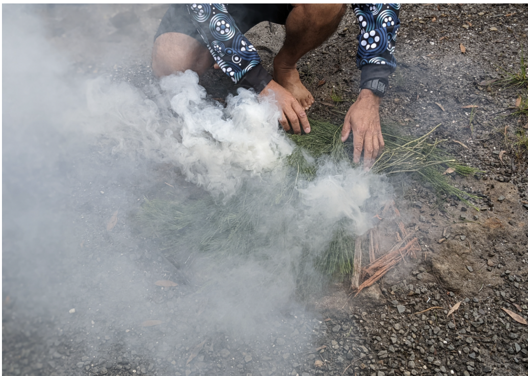
Matt Simms, Djiriba Waagura, Walking on Country experience, 15 March 2022.

The outcome of this experience shifted the focus of the project away from a cultural narrative expressed only through public art, to a site-wide cultural narrative expressed across the built, landscape and public art elements.