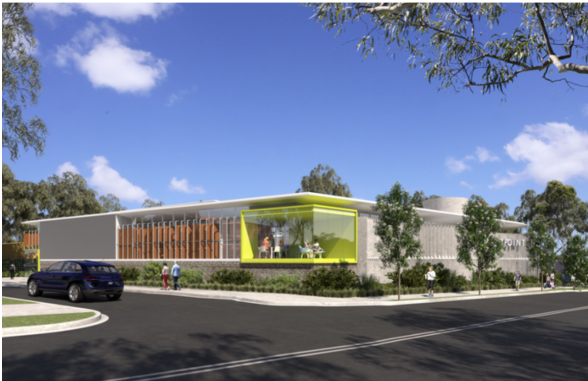
Current design for new Sanctuary Point Library. Image: Brewster Hjorth Architects