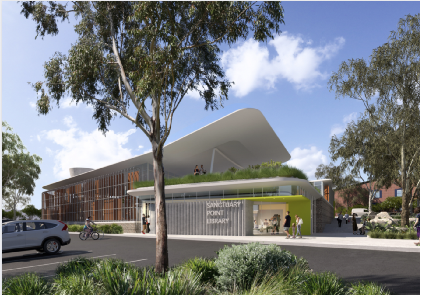
Proposed design for new Sanctuary Point Library. Image: Brewster Hjorth Architects