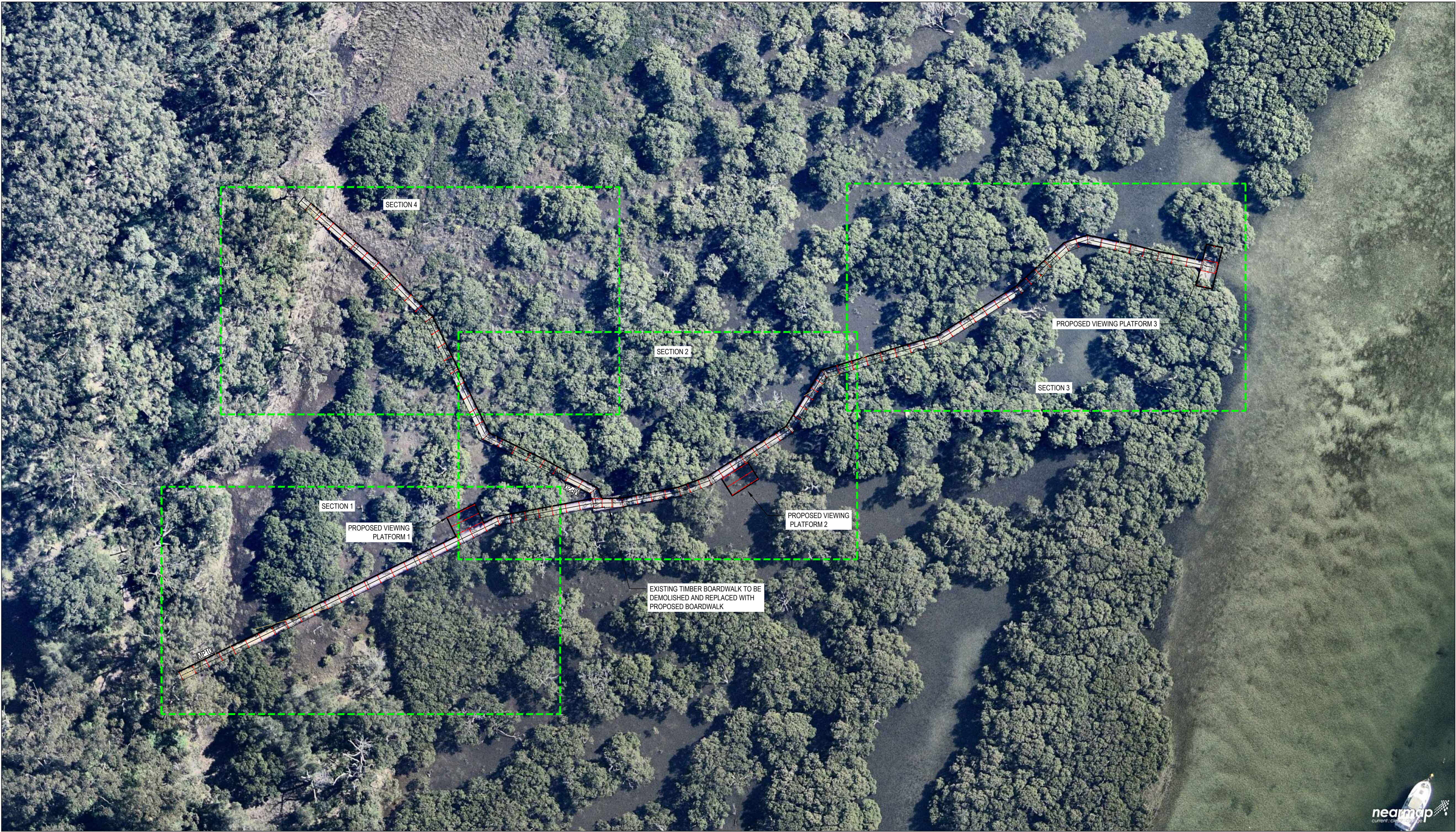
SITE PLAN SCALE 1:400