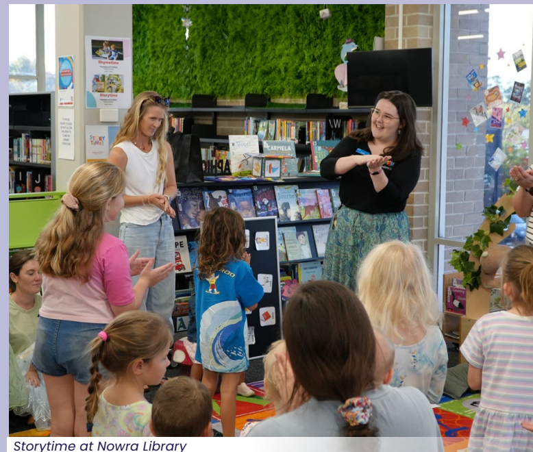
Storytime at Nowra Library

Two new junior programs to reach school-aged children were introduced at Nowra Library: LEGO Club and Crafty Kids. The re-introduction of LEGO Club started after a successful school holiday family LEGO challenge and Crafty Kids was introduced due to the popularity of drop-in craft sessions also during the school holidays.