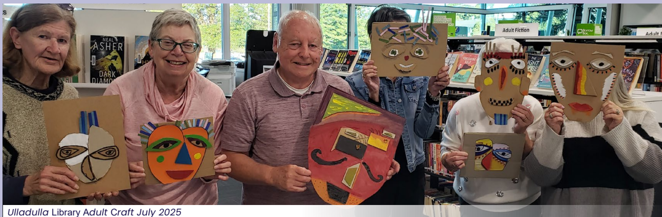
Ulladulla Library Adult Craft July 2025