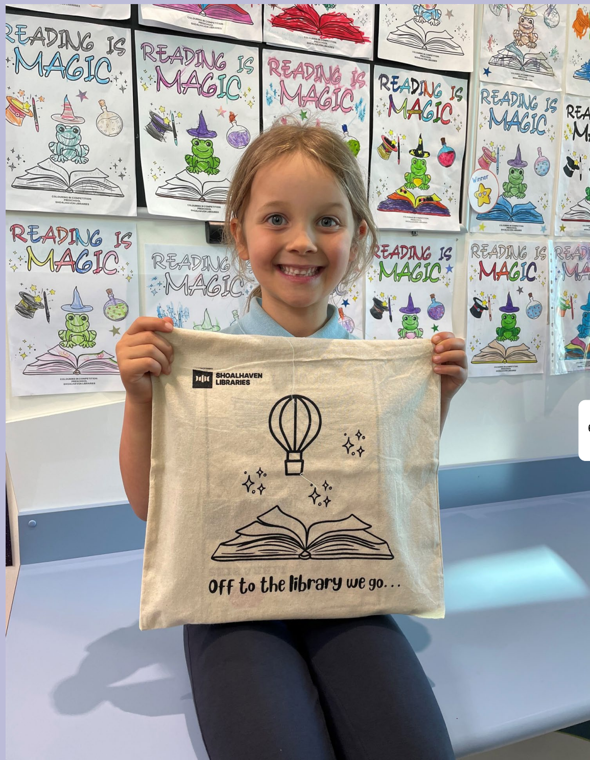
Ulladulla Library Book Week Winner

The theme for Children’s Book Week “Reading is Magic” was celebrated with Readers Theatre sessions at Sanctuary Point, Ulladulla and Nowra Libraries. Over 145 children attended these sessions. Competitions for all ages – including colouring, bookmark design and short story writing prompts – were held across all branches. The celebrations also featured special storytimes, Book Week displays and craft activities.