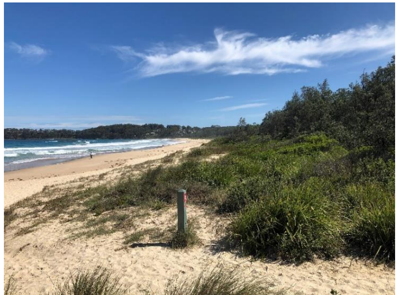
Tall trees as part of the natural dune system at Narrawallee Beach, October 2021.

Council has a rigorous program to closely monitor and respond to acts and reports of vegetation vandalism. This is supported by Council's Vegetation Vandalism Prevention Policy .