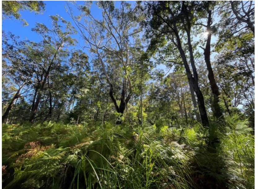
Example of Bangalay Sand Forest in good condition, Old Erowal Bay, November 2020 (Ecoplanning, 2022).

The Shoalhaven dune system also contains Bangalay Sand Forest of the Sydney Basin and South East Corner bioregions , a listed threatened ecological community under the Biodiversity Conservation Act 2016 (NSW). Thus, it is vitally important that degradation and fragmentation of dune system vegetation is minimised to ensure the conservation and continued functionality of such range restricted threatened ecological communities.