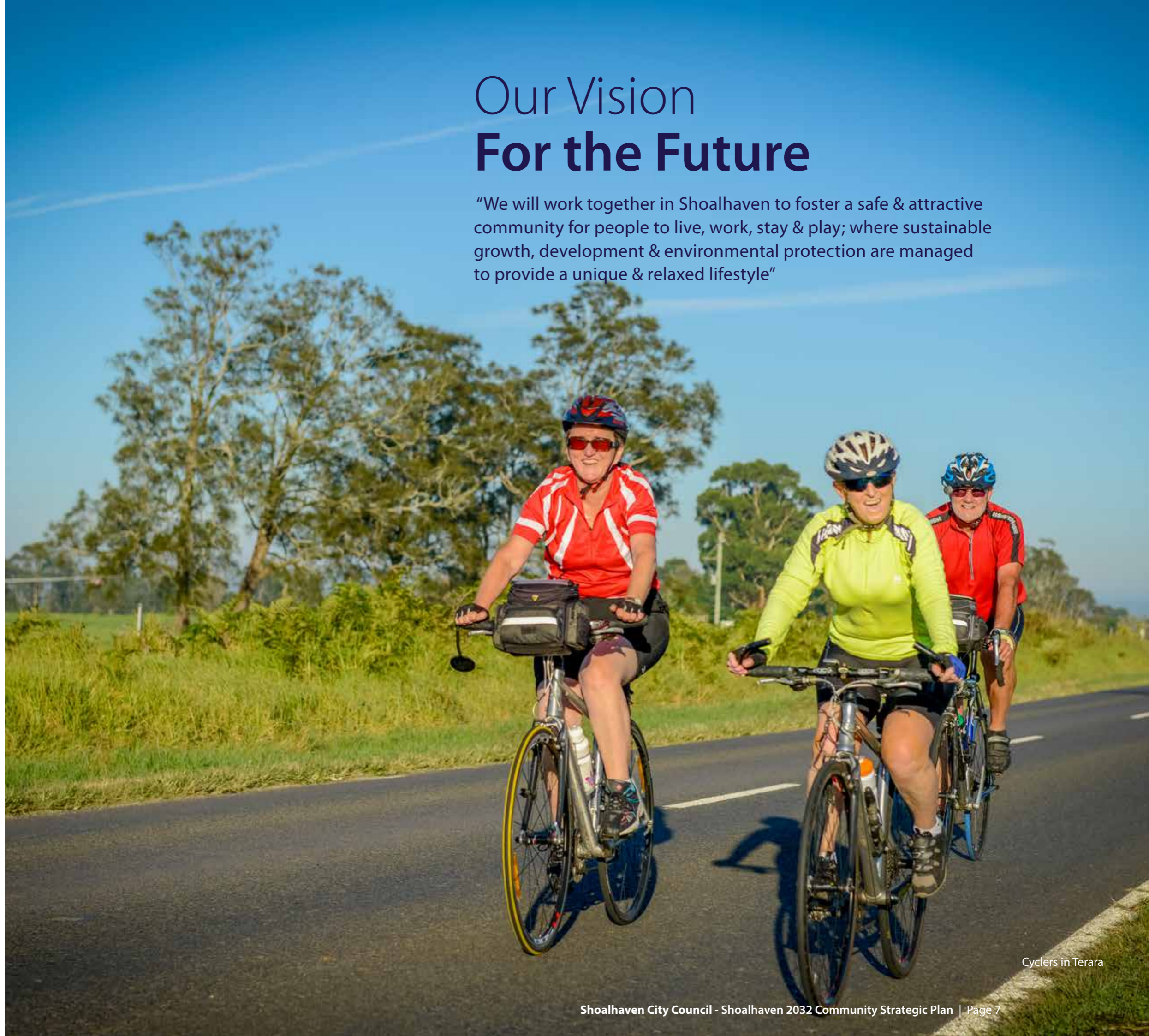
Cyclers in Terara

"We will work together in Shoalhaven to foster a safe & attractive community for people to live, work, stay & play; where sustainable growth, development & environmental protection are managed to provide a unique & relaxed lifestyle"