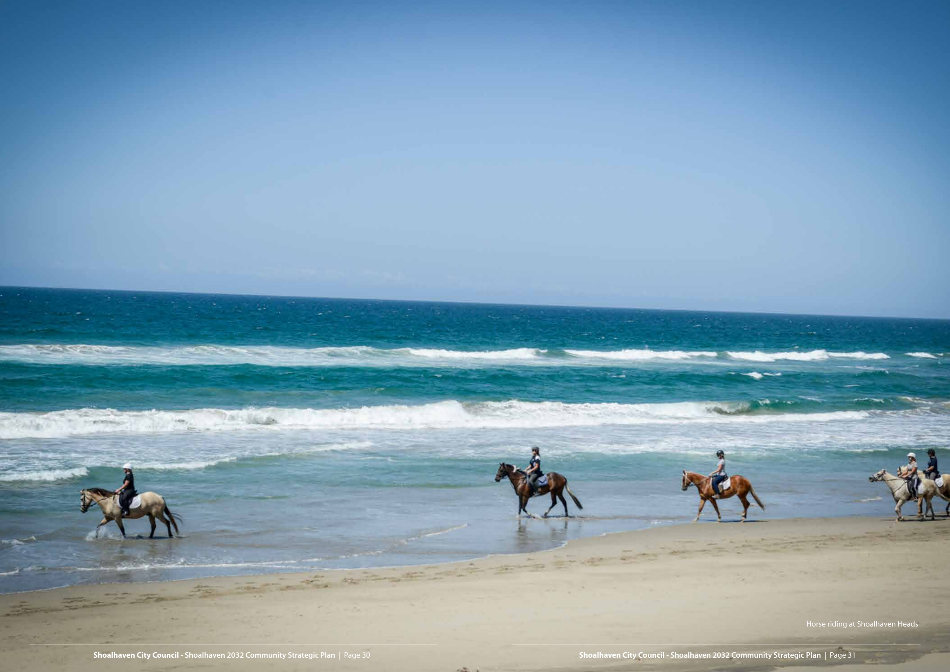
Horse riding at Shoalhaven Heads