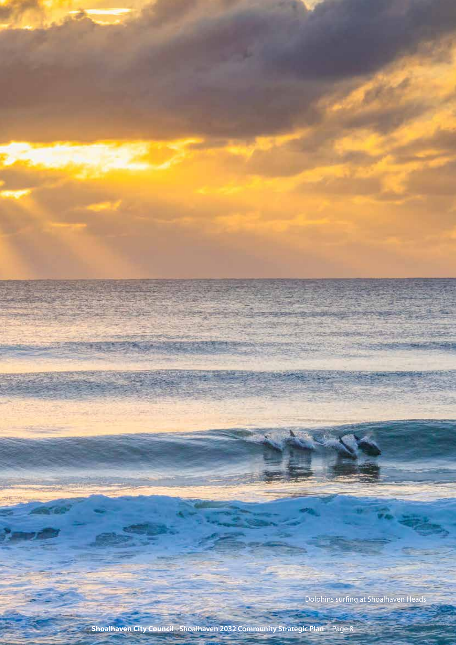
Dolphins surfing at Shoalhaven Heads