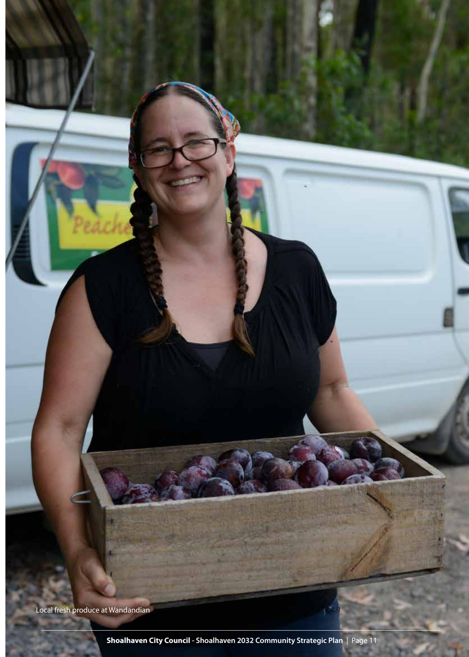
Local fresh produce at Wandandian

The Shoalhaven population has a strong sense of community, a desire to help one another, friendly, welcoming and caring. Community involvement in Council and community activities is reflective of the large numbers attending key events held throughout the year.