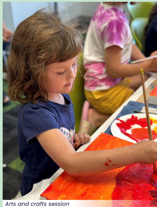
Arts and crafts session

Heritage NSW honoured Kiama born author and essayist Charmian Clift by installing a blue plaque at Kiama Library. Charmian's writing was often inspired by her hometown and it is a fitting tribute that the library was chosen as the point of connection. The plaque commemorates Charmian's long-lasting impact on literature and culture and celebrates her many writing achievements. The tribute is also supported by our library collections and our walking tour app, Remembering Charmian Clift.