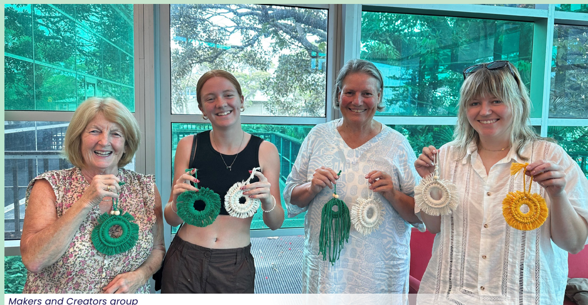
Makers and Creators group