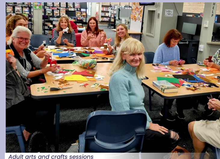
Adult arts and crafts sessions