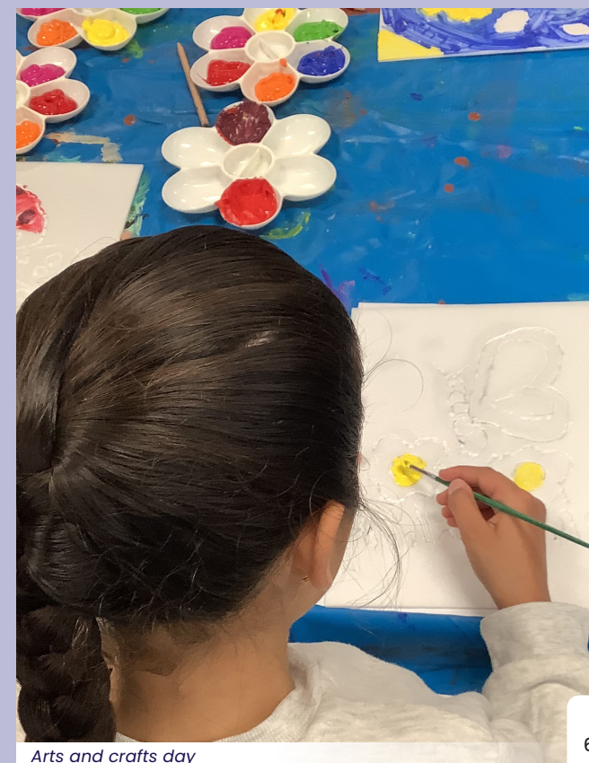
Arts and crafts day