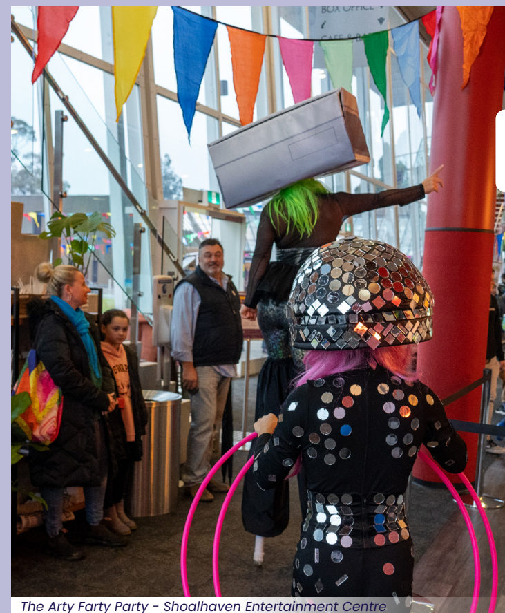
The Arty Farty Party - Shoalhaven Entertainment Centre