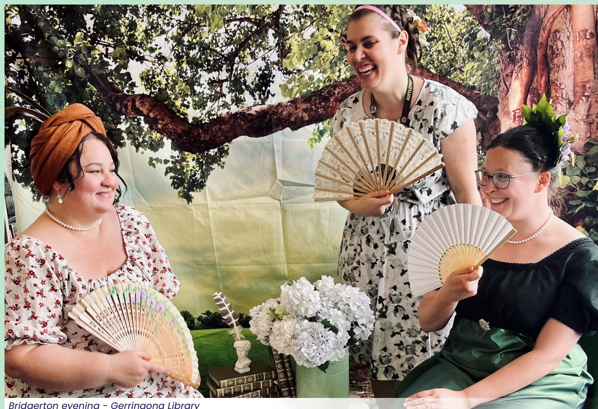
Bridgerton evening - Gerringong Library