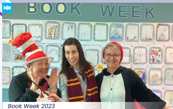
Book Week 2023

Children's Book Week continues to be a major drawcard for children to visit the library. The theme this year was "Read, Grow, Inspire" and all branches ran competitions around this theme. Winning bookmarks from the 'Design a Bookmark' competition were produced and added to the library's collection of free bookmarks for customers to take and use. There were also special storytimes, amazing displays, readers theatre performances and the famous Book Week Roadshow that visited outlying areas of the Shoalhaven.