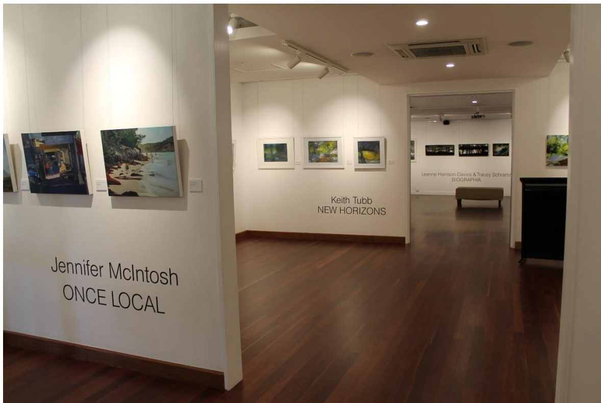
View of Foyer, Access and East Galleries