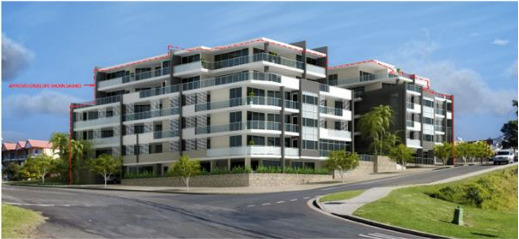
Proposed Photomontage SE Elevation shot from Cnr Burrill St South & Wason Street