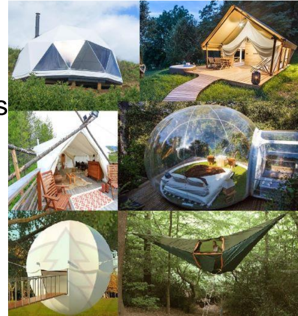
Examples of ‘innominate uses’