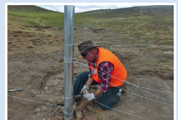
BlazeAid volunteer hard at work.