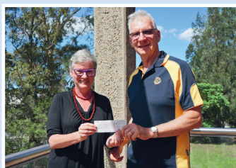
Nowra Rotary donated $5,000 to the Mayoral Relief Fund.