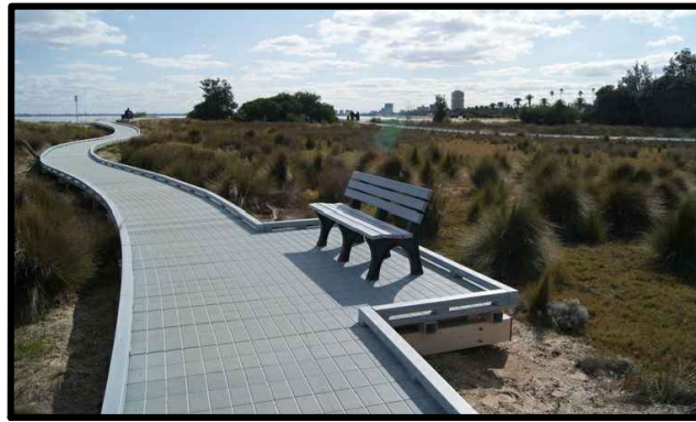
Proposed boardwalk - Recycled composite product