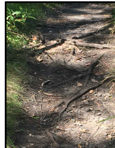
Proposed gravel track to cover exposed tree roots