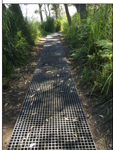
Proposed boardwalk - Fiberglass/recycled plastic