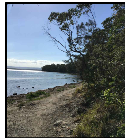
Proposed boardwalk around rocks