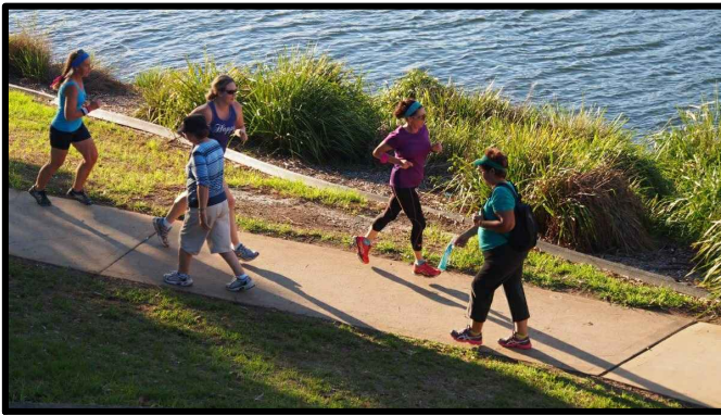
Proposed shared path - sandstone coloured concrete