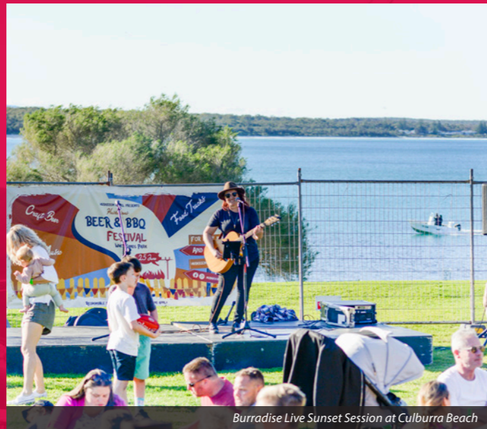
Burradise Live Sunset Session at Culburra Beach