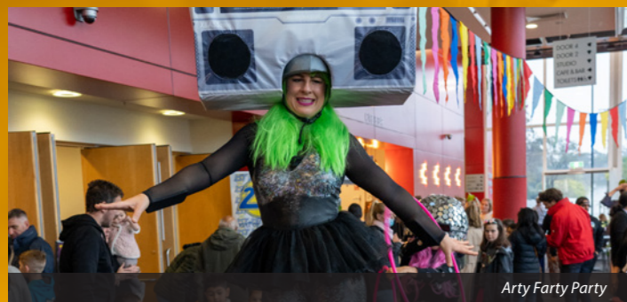
Arty Farty Party

Appointed 2 museum advisors to support the volunteer led Shoalhaven Museums on collection care.