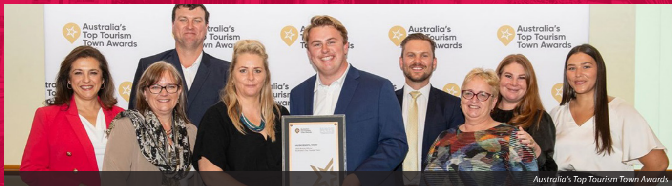
Australia's Top Tourism Town Awards