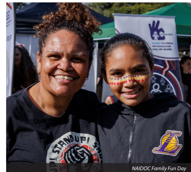
NAIDOC Family Fun Day