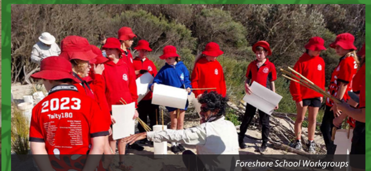
Foreshore School Workgroups