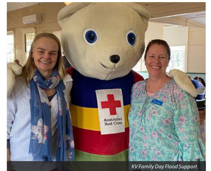
KV Family Day Flood Support

Social recovery support continues to focus on supporting community members who have their daily routines affected by the ongoing road repair works.