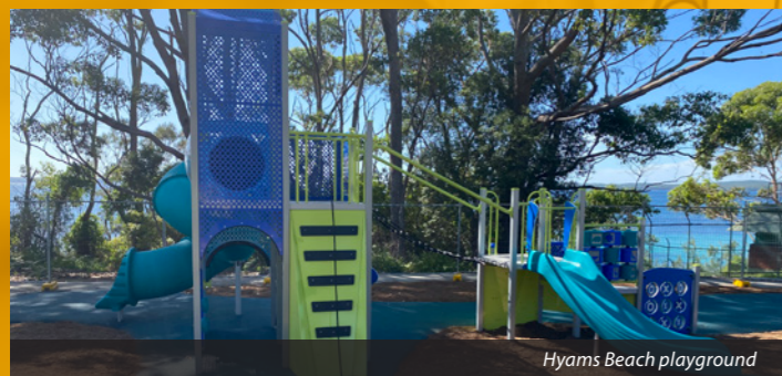
Hyams Beach playground