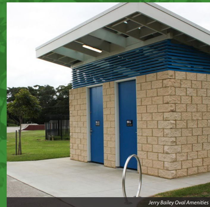
Jerry Bailey Oval Amenities

Won the 'Transitioning to a Circular Economy Award' for its integrated approach to resource recovery, prioritising reuse over recycling.