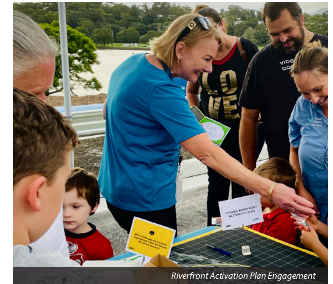
Riverfront Activation Plan Engagement