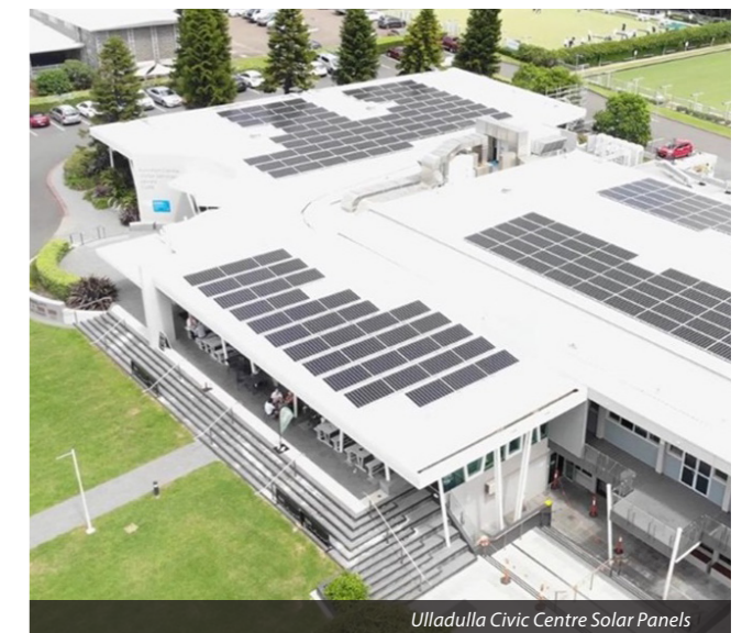
Ulladulla Civic Centre Solar Panels