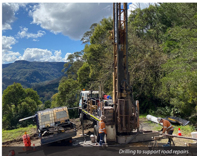
Drilling to support road repairs

Last year's natural disasters caused extensive damage to our region's road network, disrupting daily life and isolating many communities. Following the appointment of lead contractor in February 2023 to repair 38 major landslips, significant progress has already been achieved.