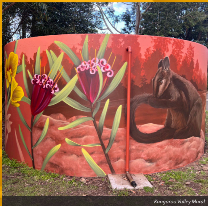
Kangaroo Valley Mural