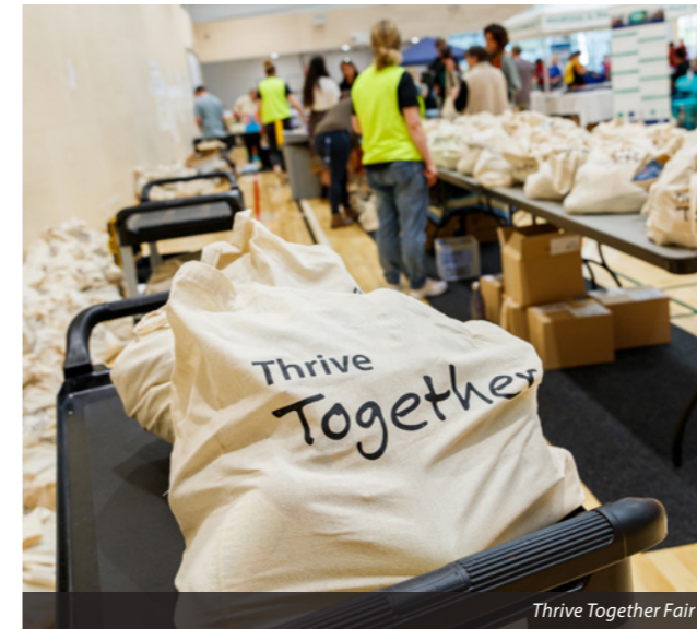
Thrive Together Fair