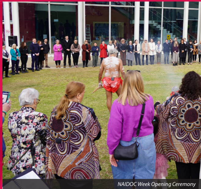
NAIDOC Week Opening Ceremony

Council endorsed the preparation of revised land use planning strategies and Local Environmental Plan, Development Control Plan, including work on the inclusion of local character considerations.