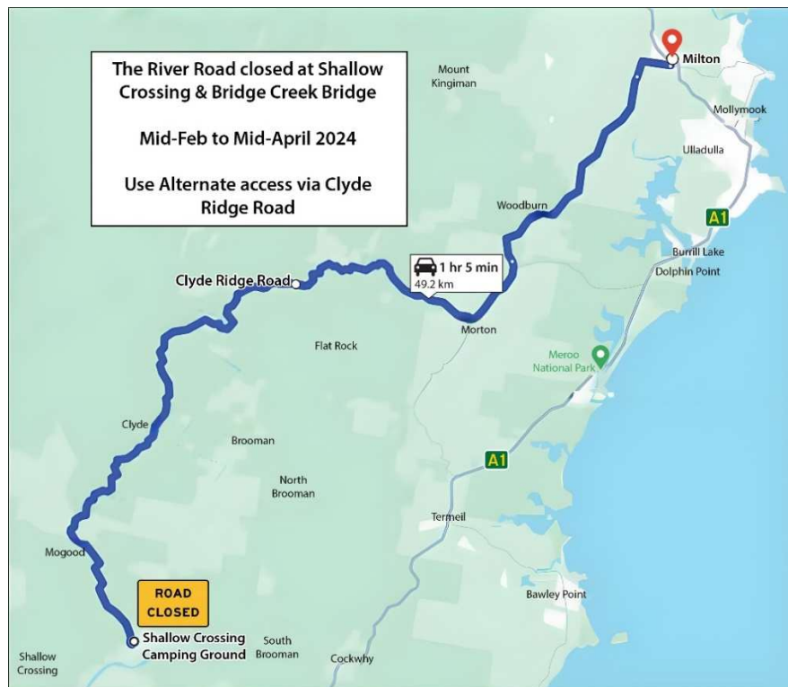
Proposed Route Travelling to/from the North